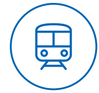
METRO 1 STATION 300 METRES