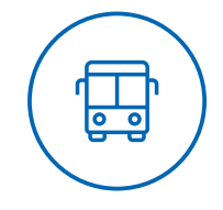
BUS DEPOT 250 METRES