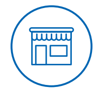
GHATKOPAR MAIN MARKET 200 METRES